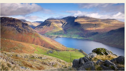
Scafell Pike is England's highest mountain which is 977 metres (3,210 feet) tall.

Wales is also famous for its impressive mountains. The highest peak is Snowdon and it's 1085 metres (3,560 feet) high. This mountain was once part of a giant crater, formed by the collapse of a volcano 450 million years ago. Since then, it has been shaped by glaciers, and more recently weathered by the alternate freezing and warming (or thawing) weather. There's a cafe and visitor centre at the summit of Snowdon that won an award for its special design. Its claim to fame is that there is no building found at a higher place (or altitude) anywhere in the UK today.