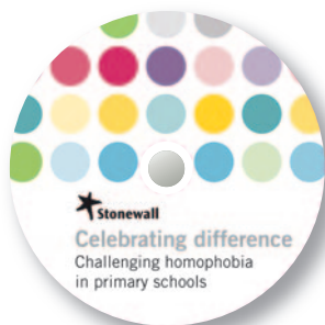
Celebrating difference: Challenging homophobia in primary schools (2011) 28 minute primary school staff training DVD