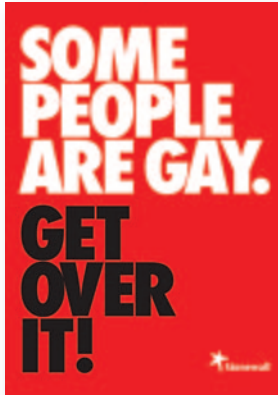
Some People Are Gay. Get Over It! posters, postcards and stickers. Posters are also available in a range of different languages.