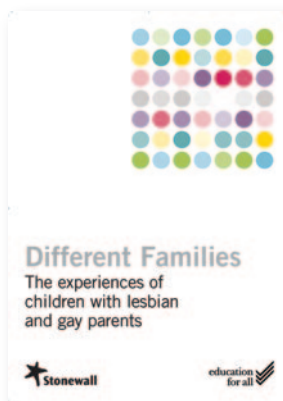
Different Families: the experiences of children with gay parents (2010)