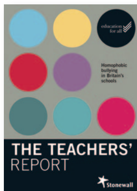
The Teachers' Report (2009): YouGov polling of over 2,000 primary and secondary school staff about homophobic bullying