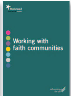
Education Guides – including Challenging homophobic language; Primary best practice guide; Effective school leadership and Working with faith communities