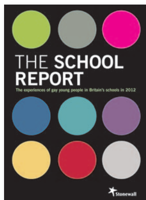
The School Report: The experiences of gay young people in Britain's schools in 2012