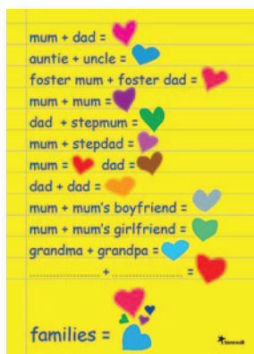
Different Families posters help schools to celebrate difference